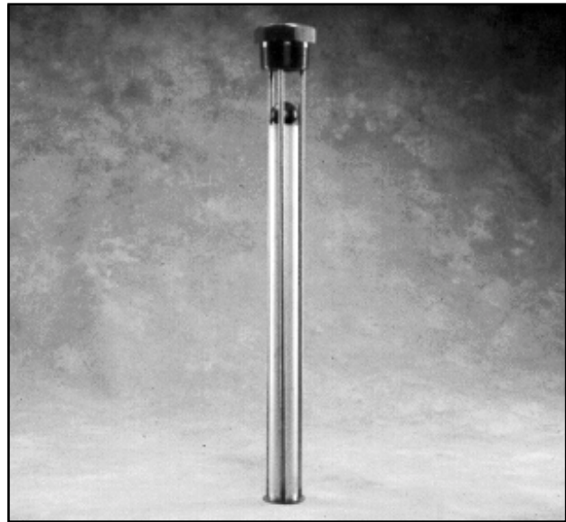
Model 80 Gas Scrubber Valve